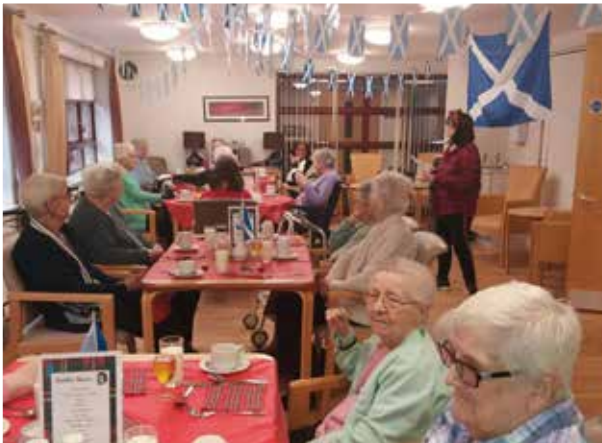
Burns night celebrations at Jamaica Court, Greenock.