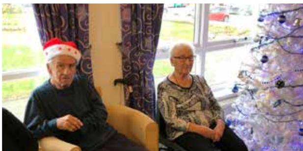
Braehead Gardens, Buckhaven