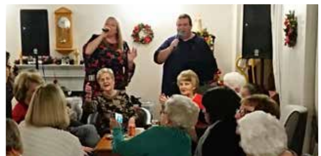
Springfield Gardens, Uddingston