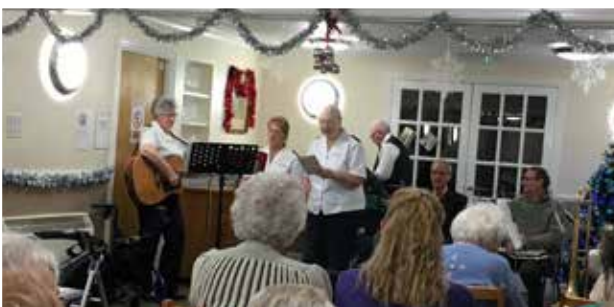
Quayside Court, Perth