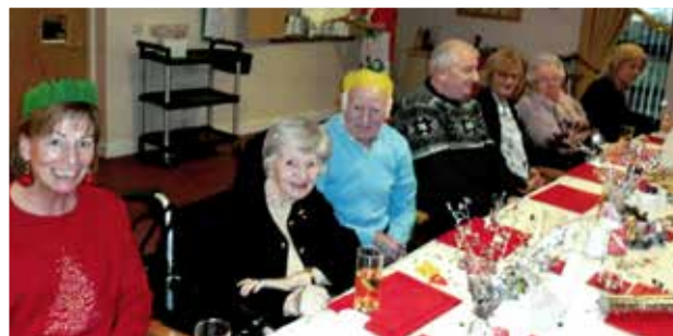
Broomfield Gardens, Airdrie