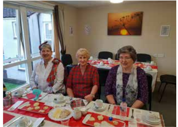
Tenants of Inglefield Court, Airdrie enjoying their Burns lunch.