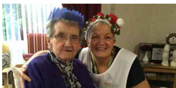
Glebe/Warrick Court, Cumnock