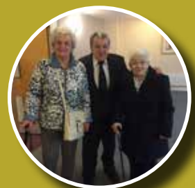
Neighbourhood News Page 26