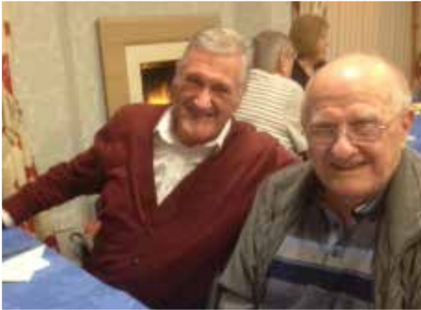
Bonfire Night dinner at Emily Court, Gorebridge.