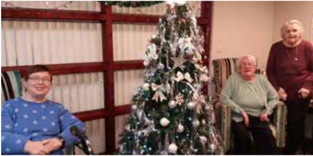
Jamaica Court, Greenock