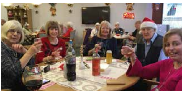
Donaldson Court, Edinburgh