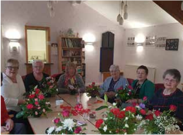
The craft group from Southfield Court in Dunbar enjoyed an afternoon floral art demonstration.