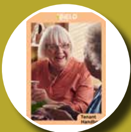
New Tenant Handbook Page 11