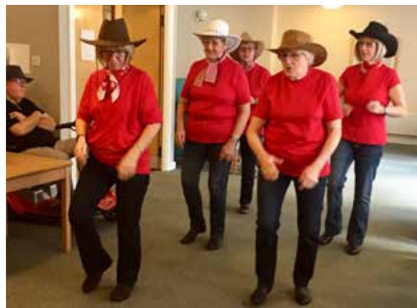
Skelmorlie Stompers line dancers from Crosshill Gardens, Port Glasgow.