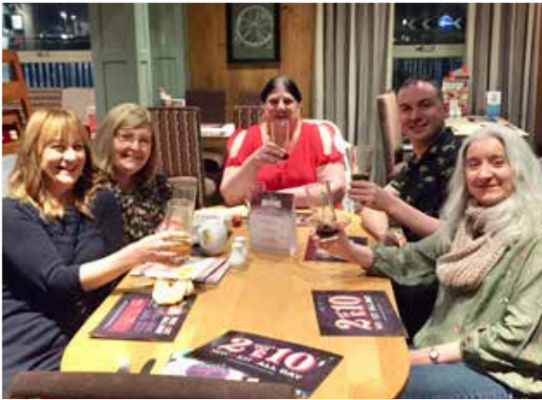
Crosshill Gardens, Port Glasgow hold volunteer celebration at a local restaurant, everyone enjoyed good food in great company!