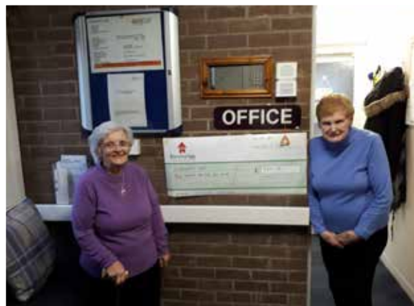
Tenants from Moorfoot Court, Bonnyrigg with cheque from local community charity shop which will be used to buy garden furniture.