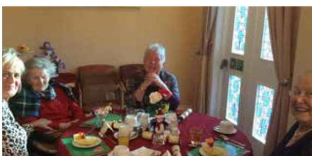
Fife Court, Bothwell