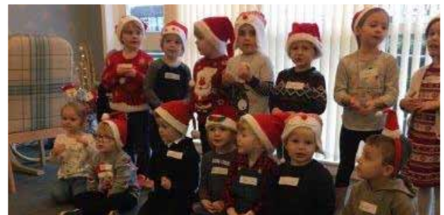
Pentland View Court, Livingston