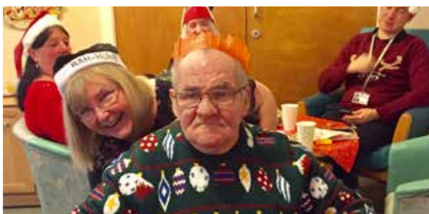
Crosshill Gardens, Port Glasgow