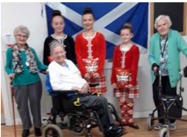
St Andrews Day celebrations at Jamaica Court, Greenock.