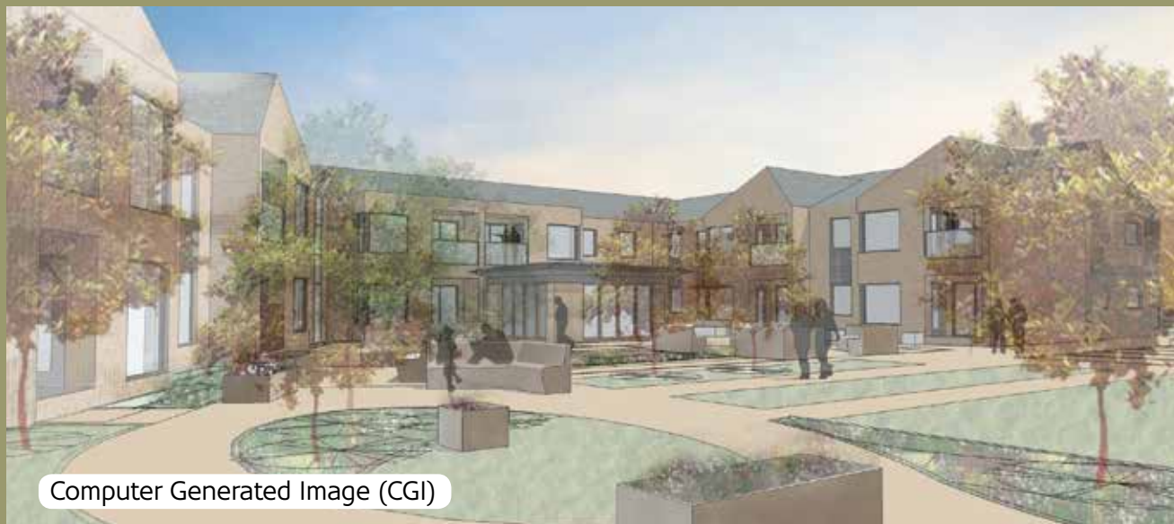
Computer Generated Image (CGI)

We reached a key stage in the proposed redevelopment of Whitehill Court, Kirkintilloch in December 2018 when our architects successfully submitted the planning application to East Dunbartonshire Council.