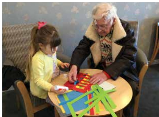
Children from Carmondean nursey visited Pentland View Court in Livingston for a craft session.