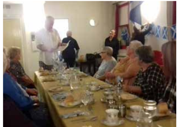
Tenants of Armadale Court, Greenock enjoying Burns Supper celebrations.