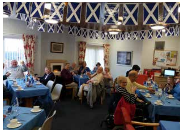
Tenants of Emily Court, Gorebridge enjoying stovies on St Andrews Day