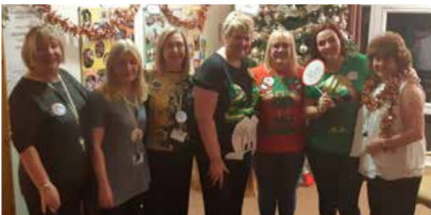
Oakburn Park, Milngavie