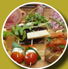
Preston Pantry Page 23