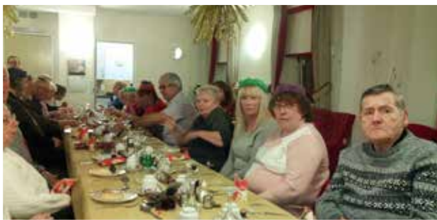
Armadale Court, Greenock