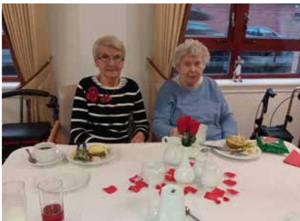
Tenants enjoying Valentines Day at Jamaica Court, Greenock.