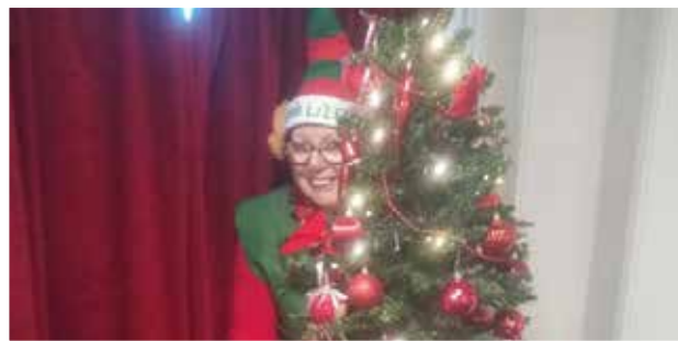
Brae Court, Linlithgow