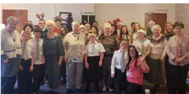
Whitehill Court, Kirkintilloch

Please send your neighbourhood news to the Communications and Marketing Team at 79 Hopetoun Street, Edinburgh. EH7 4QF or by email to business.support@bield.co.uk Some of your news is so lovely that we like to share it on Facebook and Twitter. Please let us know if you'd rather they are only published in the Bulletin.