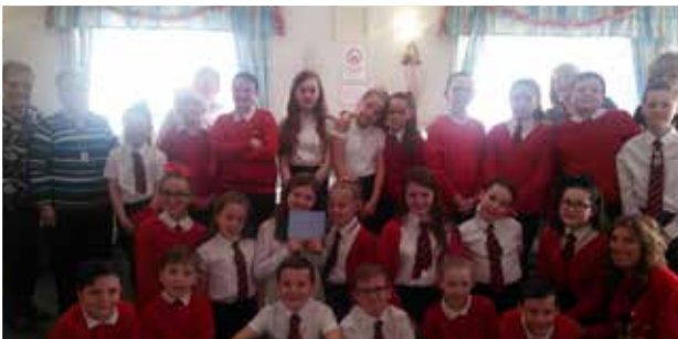
McCormack Gardens, Newarthill