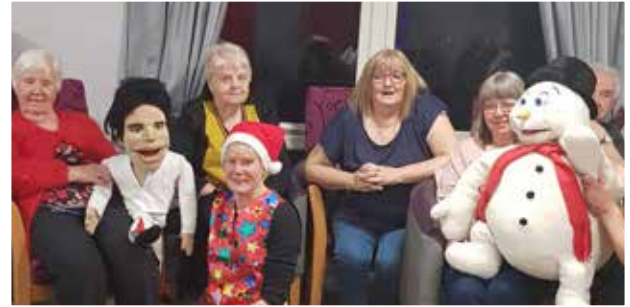
Kirkton Court, Kirriemuir