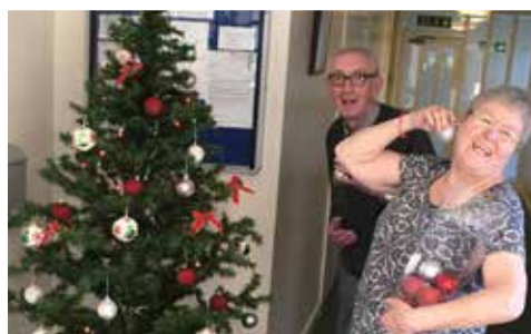
Dean Court, Bo'ness